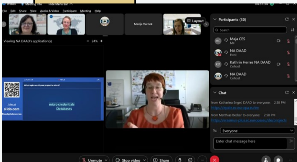
TCA seminar “Digital literacy in teaching, learning and the administration of the Erasmus+ Programme”

On 13.05.2022, the project IQ-DigitS was presented at the: