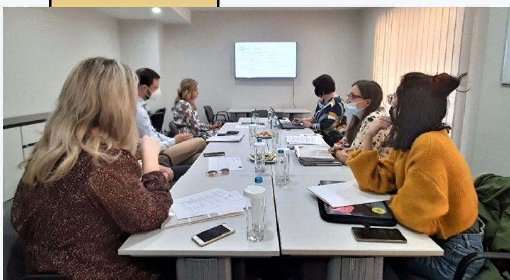
Kick off meeting Skopje 24-25.03.2022

organized by the DAAD – German National agency, within the Workshop TCA “How to support educators in the digital transition”.